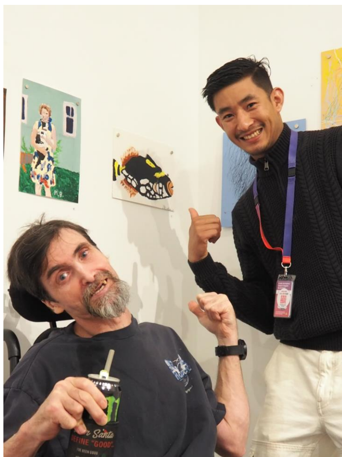
Pictured: Create Connect Artists celebrating their works from 2022-23 in exhibition 'Paper Royale'.