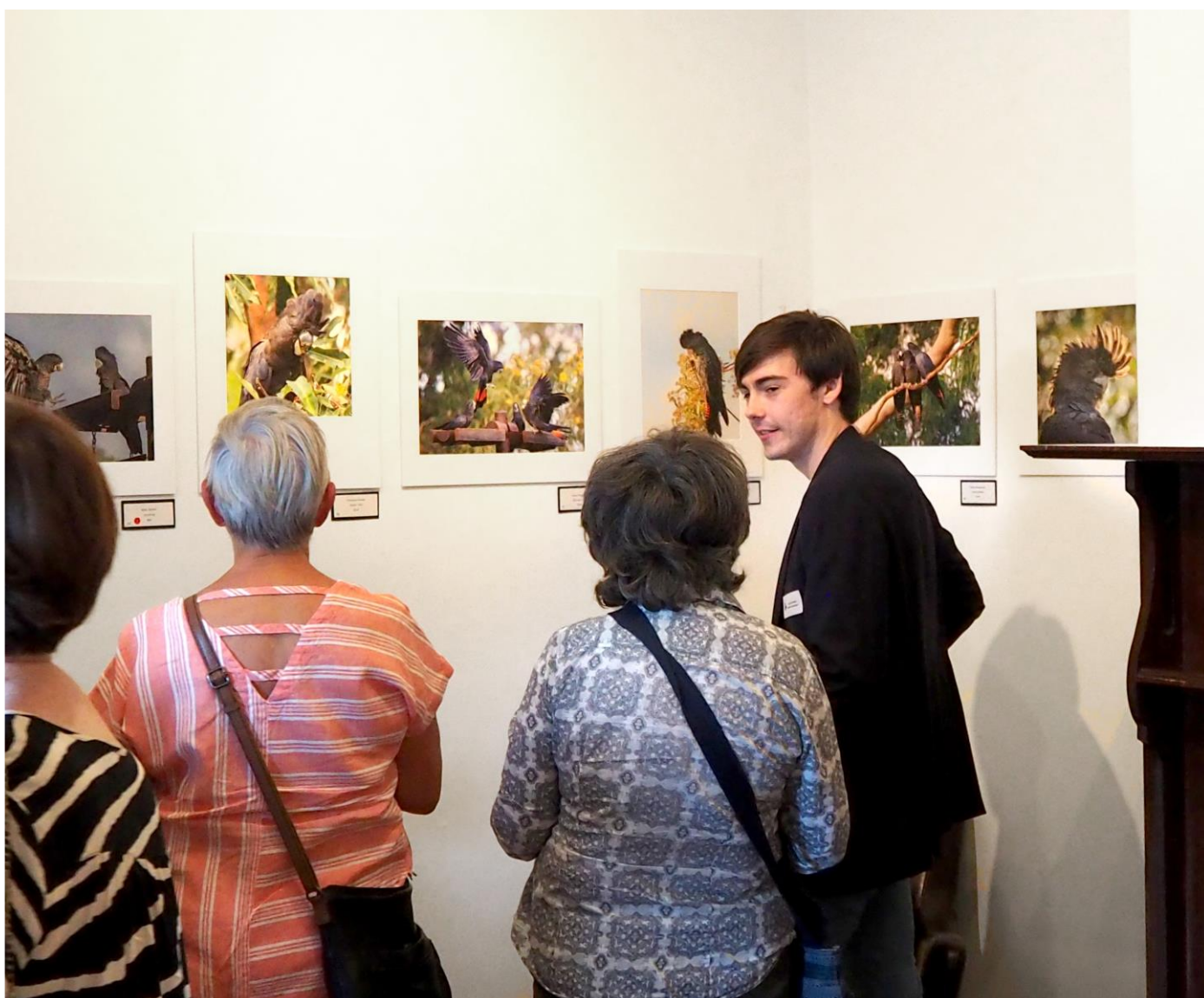
Pictured: Friends of Jirdarup Bushland Photography Competition and Exhibition 2022, held at Kent Street Gallery.